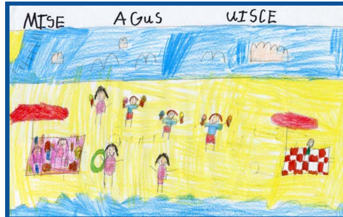
Síetra Ní Chonghail Scoil Éinne