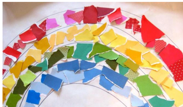
scrap paper Rainbow

http://www.planetpals.com/recycle_crafts_kids.html