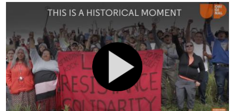
See Water Protectors in Action!