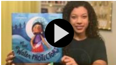
We Are Water Protectors Reading