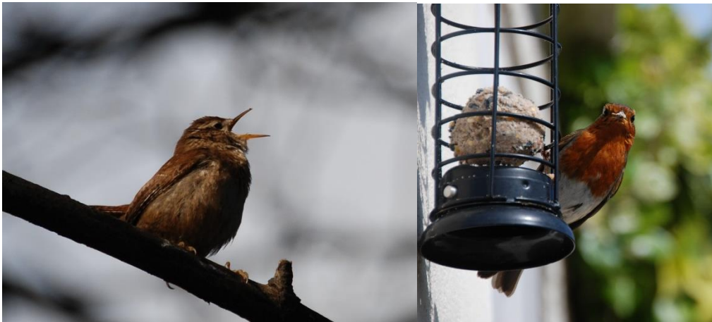
It is easy to spot this wren on a bare branch! A robin visiting a bird feeder!